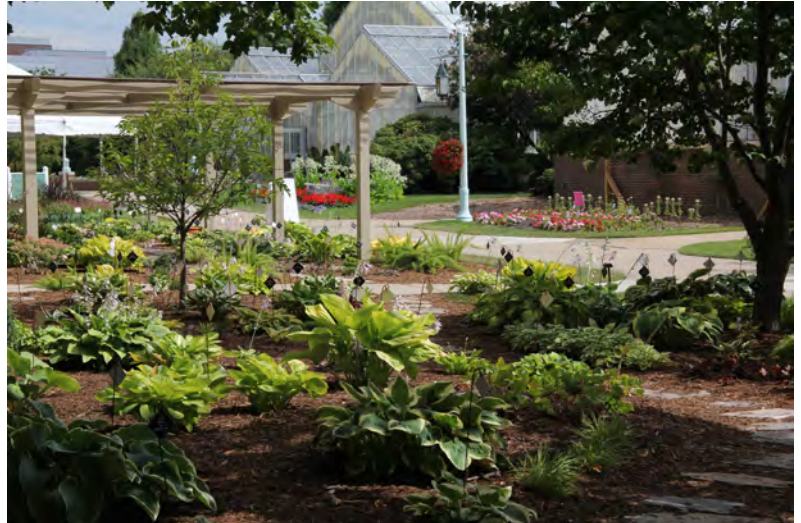
Some of Jerry's hostas on display in our Hosta collection.